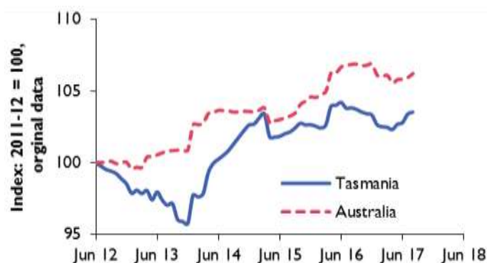
Chart 1: Aggregate hours worked, Australia and Tasmania, 12-month moving average original data