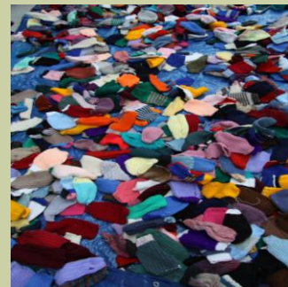
Knitted jumpers for Little penguins