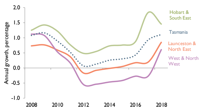
Chart 1: Tasmania's population size by LGA, as at 30 June 2018, original data