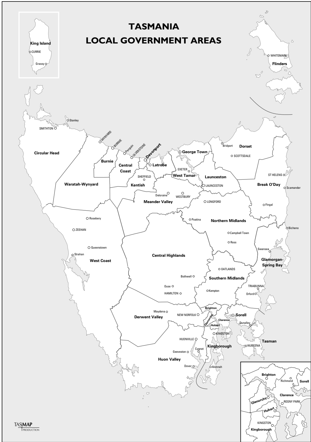
Map produced by TASMMap (www.tasmap.tas.gov.au), © State of Tasmania